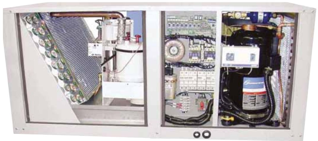
AIR COOLED 2 TON MODEL SHOWN

ClimateWorx's Series 11 is a compact ceiling mounted air conditioning unit designed to provide quiet, reliable and efficient environmental control for mission critical applications. The compact version of the Series 11 is designed to fit in a standard 2 x 4ft. standard T-bar suspended ceiling system. The nominal capacity ranges from 12Mbh (3.5kW) to 28Mbh (8.2kW). Capacities above 2.5 tons to 5 tons will suspend above the ceiling and are ducted to the space below. This versatile product can be applied in packaged or split configurations for spot cooling, or ducted installations. The Series 11 is available in air cooled, water/glycol cooled and chilled water systems.