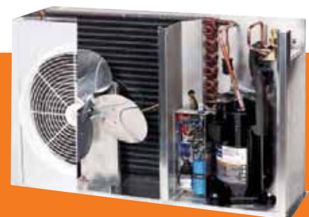
AIR-COOLED CONDENSING UNIT

Low noise propeller with robust, continuous-duty motor.