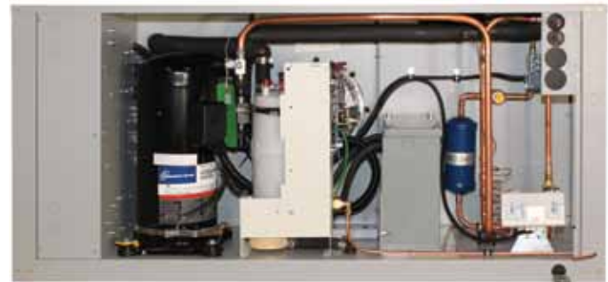
DUAL COOLED 5 TON MODEL SHOWN