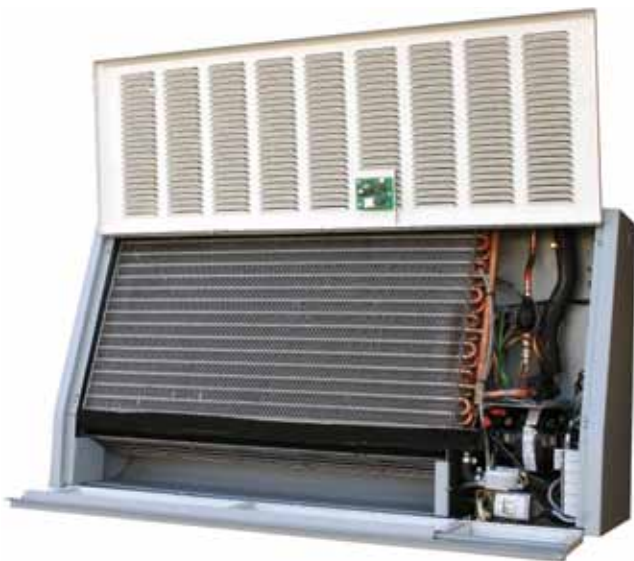
AIR COOLED COOLING ONLY MODEL SHOWN